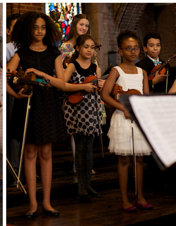
3 rd Annual Joint Concert with Opus 118 Harlem School of Music.