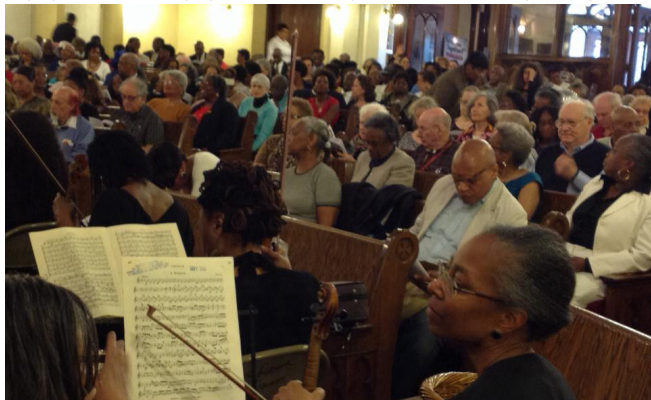
Before the performance of the Mozart Requiem .

Last year was yet another action-packed year for The Harlem Chamber Players, and we are most excited by the fact that we are forging more and more new partnerships each and every year.