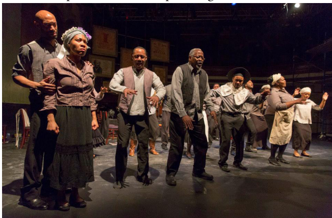
Harriet Tubman dress rehearsal at the Irondale Center in Brooklyn, NY.